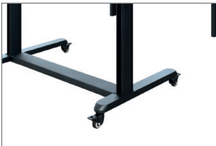
mobile thanks to castors with lock-type brake

In addition to the pre-configured systems, HAGOR offers customised special solutions in the LED sector, which can be individualised with accessories such as loudspeakers, controls and so on to meet all requirements.